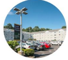
Summer Hill of Wayne, a Christian Health Community 2100 Summer Hill Road, Wayne, NJ 07470