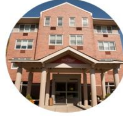
Siena Village of Wayne, a Christian Health Community 1000 Siena Vlg, Wayne, NJ 07470