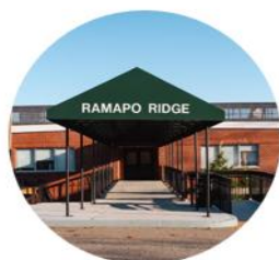
Rampo Ridge Behavioral Health, a Christian Health Hospital 301 Sicomac Ave, Wyckoff, NJ 07481