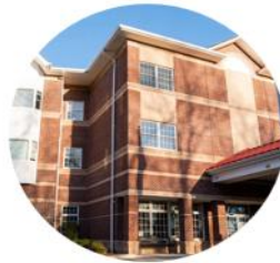
Windmere, a Christian Health Community 151 Graham Ave, North Haledon, NJ 07508