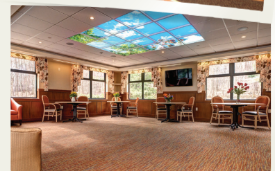
Ramapo Ridge Psychiatric Hospital C Wing Patient Lounge

What makes this renovation so special is that it was spearheaded and funded, in part, by our employees. CHCC's first-ever Employee Giving Campaign raised the necessary funds to renovate the C Wing Patient Lounge. The Bolger Foundation was so impressed with the employees' dedication to its patients that it extended a challenge grant, offering to match up to $100,000 of monies raised by the staff. CHCC employees accepted and met the challenge.