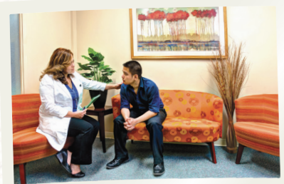
Ramapo Ridge Psychiatric Hospital