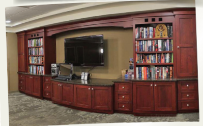
Heritage Manor East exterior and interior