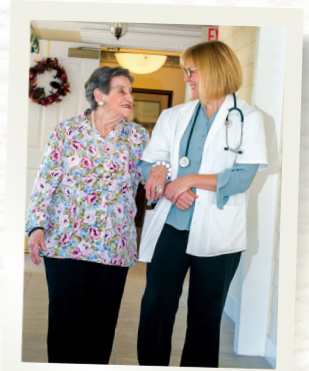
The Longview Assisted Living Residence

Heritage Manor West, a community fostering collaboration and freedom of choice, is now home to more independent seniors. Construction began in the summer of 2014 to transform this area into a more beautiful, home-like environment. Once renovations are complete in 2015, Heritage Manor West will feature a new private entrance, a porch with picturesque views of the Ramapo Mountains, an open living space with a hearth and fireplace, and a beautiful open kitchen area. Restaurant-style dining and innovative dining