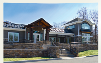
Heritage Manor West