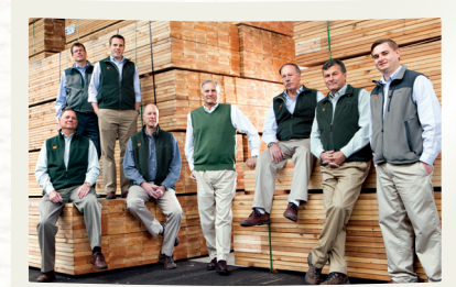
Kuiken Brothers Company Inc.

Throughout its 103-year history, Kuiken Brothers has been guided by a commitment to integrity, honesty, hard work, and community service. Reaffirming that commitment on a daily basis enabled two brothers and a cousin, all from Holland, to establish a small local construction and building-supply company that would flourish and grow to become one of the most respected businesses in the New York metropolitan area. Kuiken Brothers is an active supporter of numerous volunteer groups and non-profit associations, including Christian Health Care Center, Eastern Christian High School, Toys for Tots, and Habitat for Humanity.