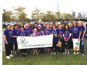
CHCC employees participated in the Walk to End Alzheimer's and raised money to help individuals with the disease. CHCC provides a continuum of care for this population.

The CHCC Outreach Team raised $5,800 in the Walk to End Alzheimer's , placing CHCC as number one for top Companies and Team Honor Roll for the Alzheimer's Association Greater New Jersey Region.