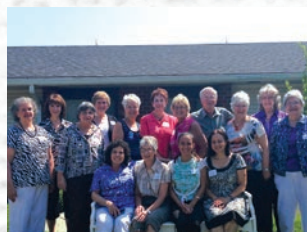
Local parish nurses gathered at Christian Health Care Center for the first Parish Nurse Ministry Forum.

Pastoral Care launched a Parish Nurse Ministry Forum to provide an opportunity for parish nurses and other church leaders interested in parish health ministry to meet, network, and interact on a topic of interest relevant to their work.