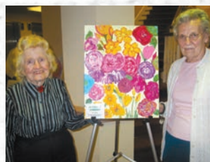
The Resident Art Exhibit showcased the creativity of Longview residents.

Longview held its fourth annual Resident Art Exhibit . The exhibit featured 100 pieces of art in many different mediums, including acrylic paint, clay, mosaic tiles, and silk painting. Several pieces were also on display at the Louis Bay 2nd Library in Hawthorne.