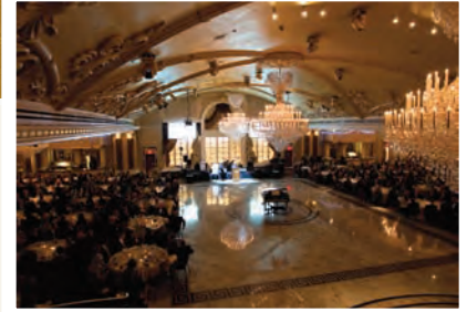
The Venetian in Garfield was the setting for the Centennial Gala.