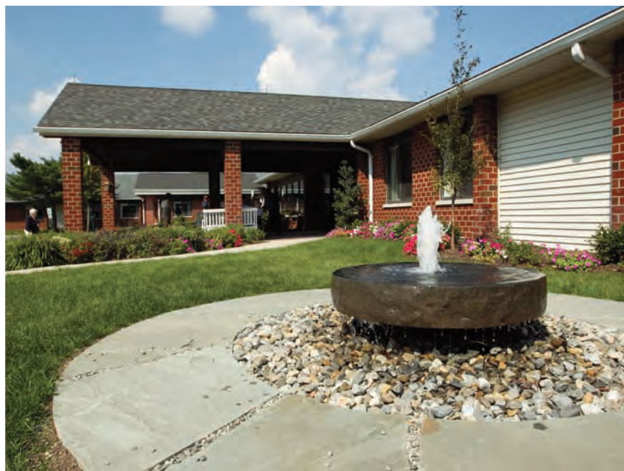
A time capsule will be buried underneath the centennial fountain outside the Commons.

A CENTENNIAL FOUNTAIN AND TIME CAPSULE near the Commons, marigold gardens outside Christian Health Care Adult Day Services of Wayne and Wyckoff, and banners lining Christian Health Care Center's entryways were all visible tributes in honor of the Center's centennial. In 2012, a tulip garden planted in 2011 by the windmill at the De Roo House will be another visible reminder of the milestone.