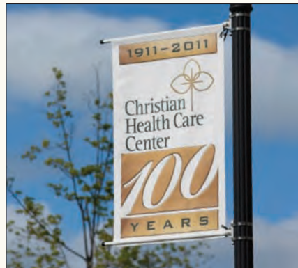
Centennial banners lined the entryways of Christian Health Care Center.