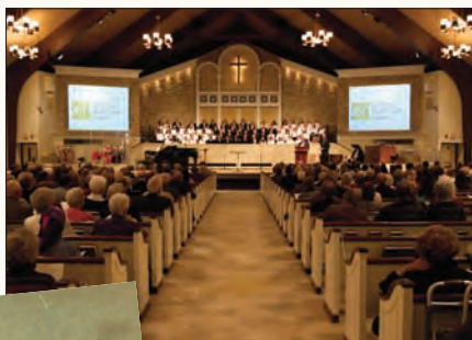
The Christian Health Care Center Centennial Worship Service was held at Hawthorne Gospel Church.